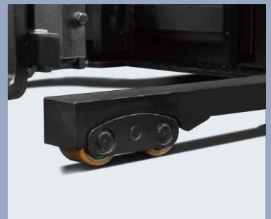
The structure of rotary load wheel offers the truck better passing ability