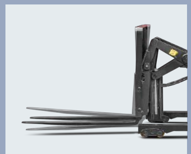
Mast tilting function is easy for entry in/out the pallet