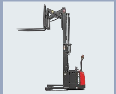
Travel speed is lowered automatically when fork is lifted to specified height