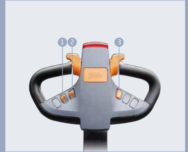
FREI multi-function tiller